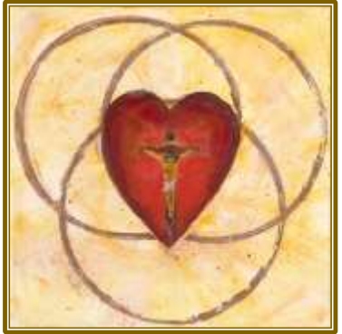
"I, when I am lifted up from the earth, will draw all men to myself John 12:32

PRAYER OF LOVE AND THANKSGIVING O my Jesus, draw us to Yourself so we might have life through You and look with Your Divine Love upon every one. Lord, we love You and we thank You for the gift of every one! Pour Your precious healing blood upon us. Wash us! Restore us! Fill us with Your Divine Light, Life, and Love!