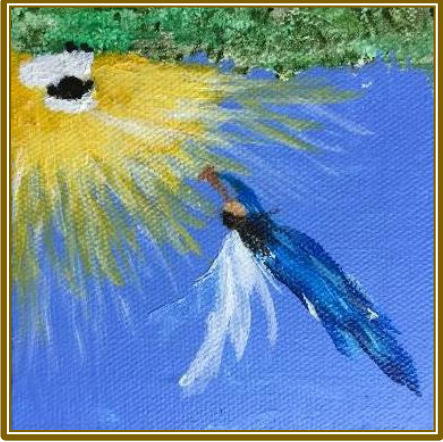
Rejoice with me, for I have found my lost sheep. Luke 15:6